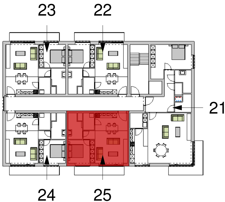
App. 25 - situering