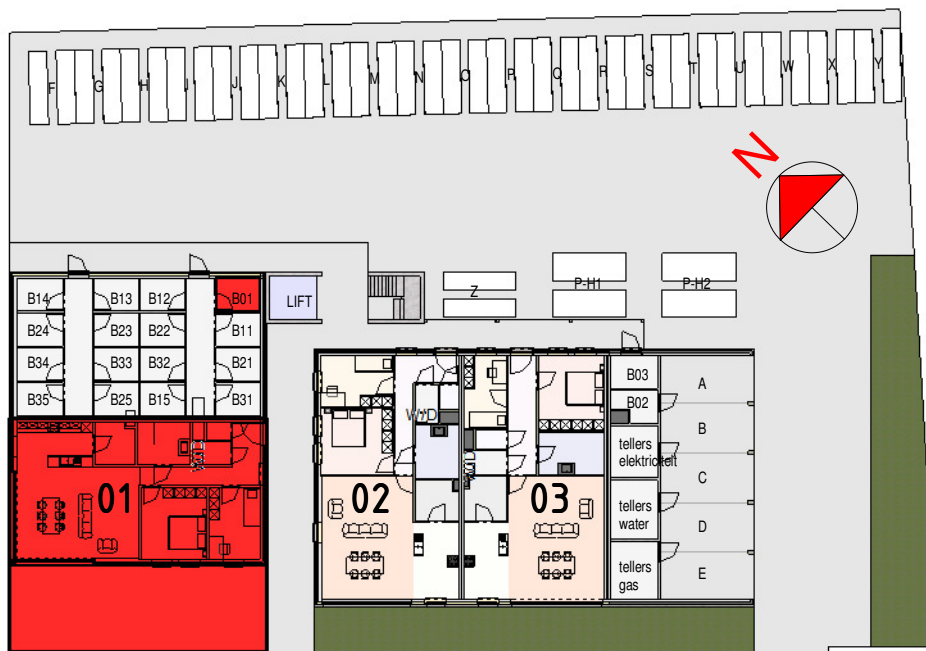
situatie A01 + B01